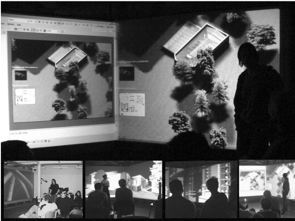
Figure 3. Beyond the tool – Integrating the physical and the virtual