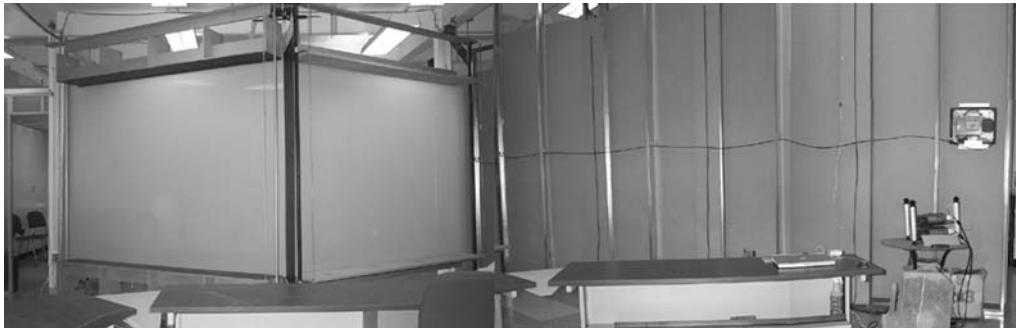
Figure 1. Back View showing one projector set and screen